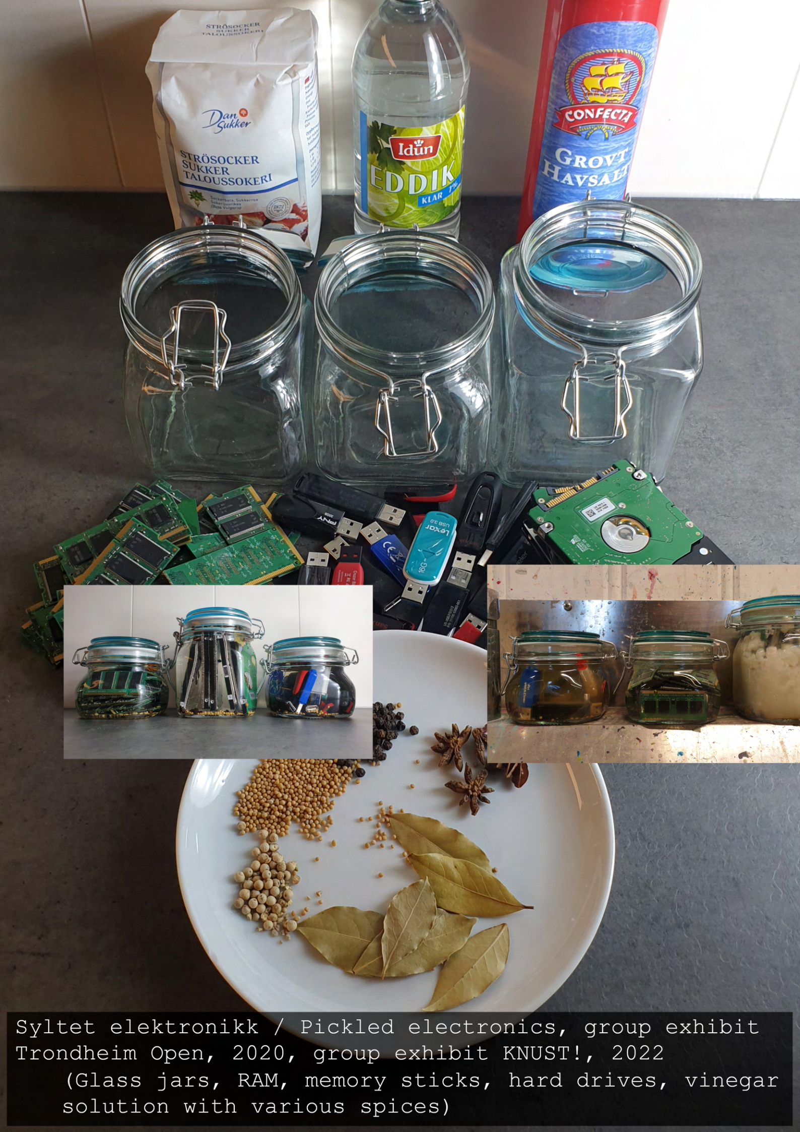
Syltet elektronikk / Pickled electronics, group exhibit Trondheim Open, 2020, group exhibit KNUST!, 2022 (Glass jars, RAM, memory sticks, hard drives, vinegar solution with various spices)